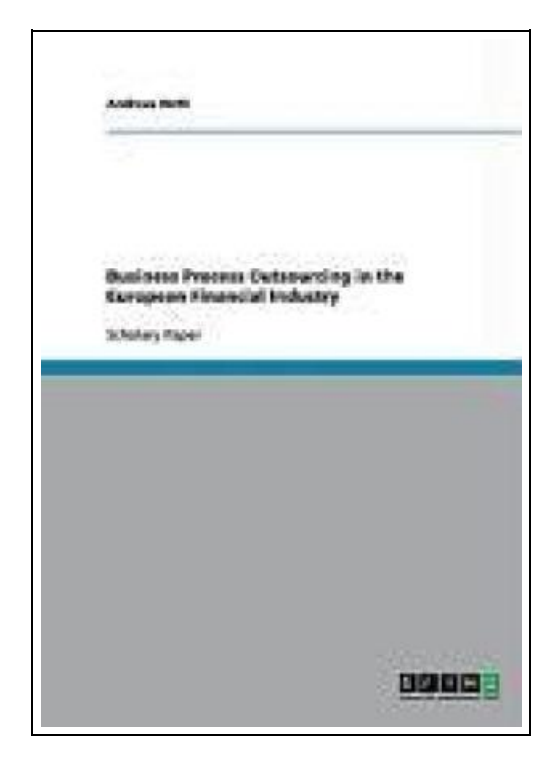
Filesize: 6.4 MB