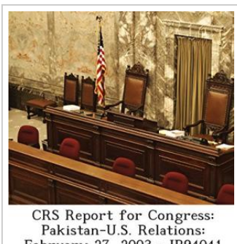
CRS Report for Congress: Pakistan-U.S. Relations: February 27, 2003 - IB94041 Congressional Research Service: The Library of Congress, Alan Kronstadt