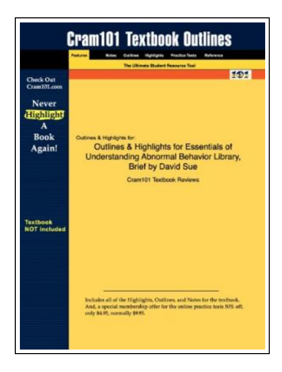
Filesize: 4.14 MB