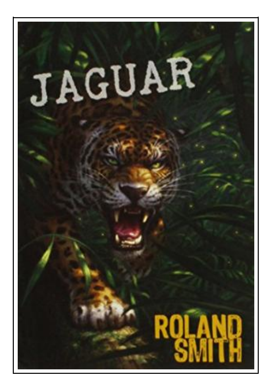
Filesize: 9.61 MB