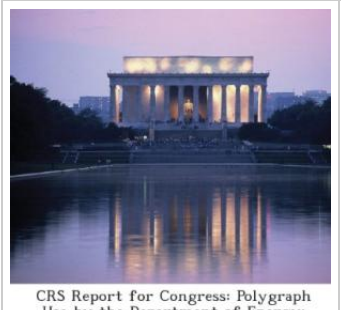
CRS Report for Congress: Polygraph Use by the Department of Energy: Issues for Congress: February 14, 2007 - RL31988

Congressional Research Service: The Library of Congress, Alfred Cumming