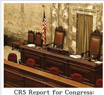
CRS Report for Congress: The Trans-Pacific Partnership Agreement Congressional Research Service: The Library of Congress, Ian F. Fergusson