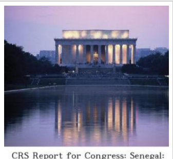
CRS Report for Congress: Senegal: Background and U.S. Relations: August 16, 2010 - R41369

Congressional Research Service: The Library of Congress, Alexis Arieff