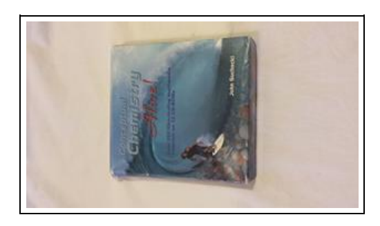
Filesize: 2.33 MB