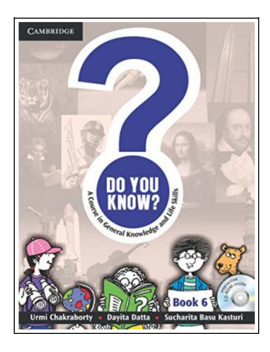
Filesize: 8.11 MB