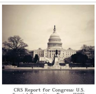
CRS Report for Congress: U.S. Special Operations Forces (SOF): Background and Issues for Congress