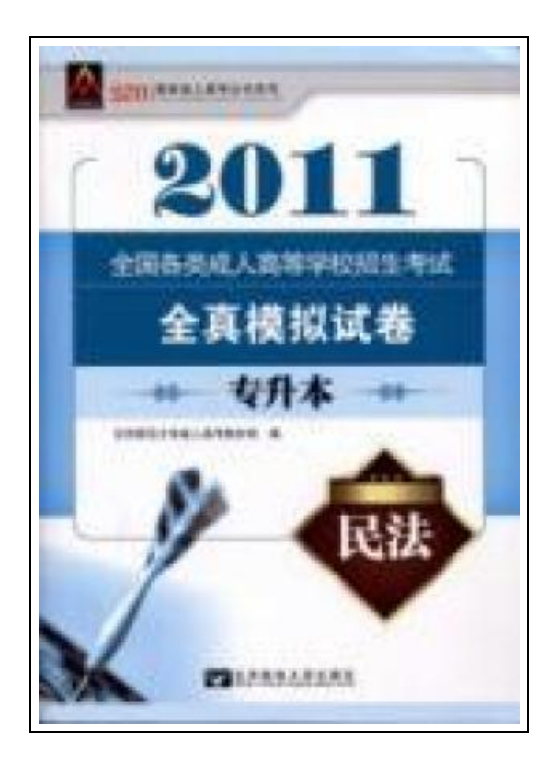
Filesize: 5.44 MB