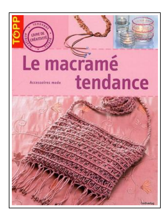
Filesize: 5 MB