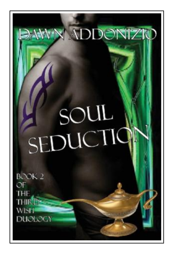
Filesize: 1.2 MB