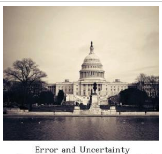
Error and Uncertainty Quantification in the Numerical Simulation of Complex Fluid Flows