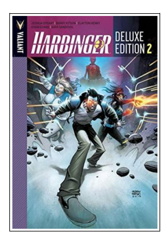
Filesize: 5.5 MB