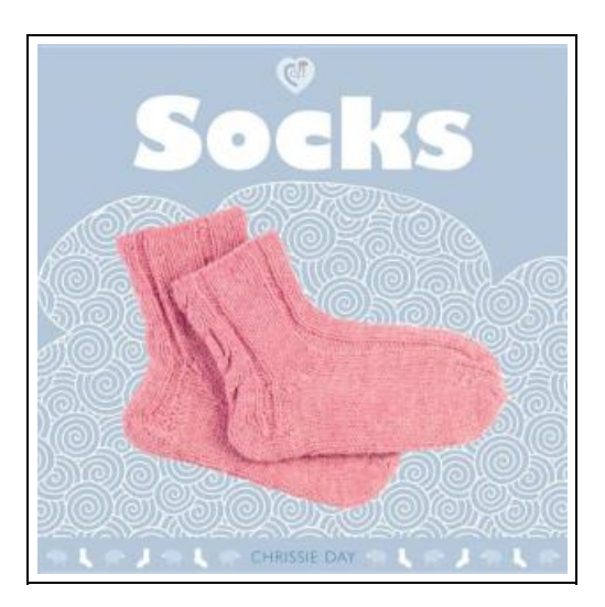
Filesize: 5.5 MB