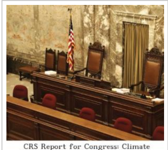
CRS Report for Congress: Climate Change: Action by States To Address Greenhouse Gas Emissions: January 18, 2007 - RL33812