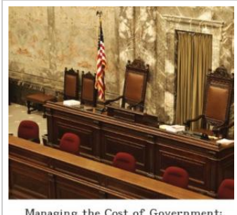
Managing the Cost of Government: Building an Effective Financial Management Structure: AFMD-85-35A

U.S. Government Accountability Office (GAO)