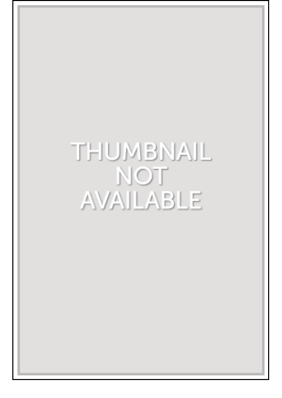
Filesize: 2.2 MB