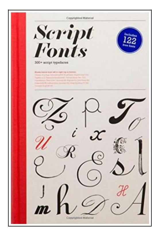
Filesize: 8.44 MB