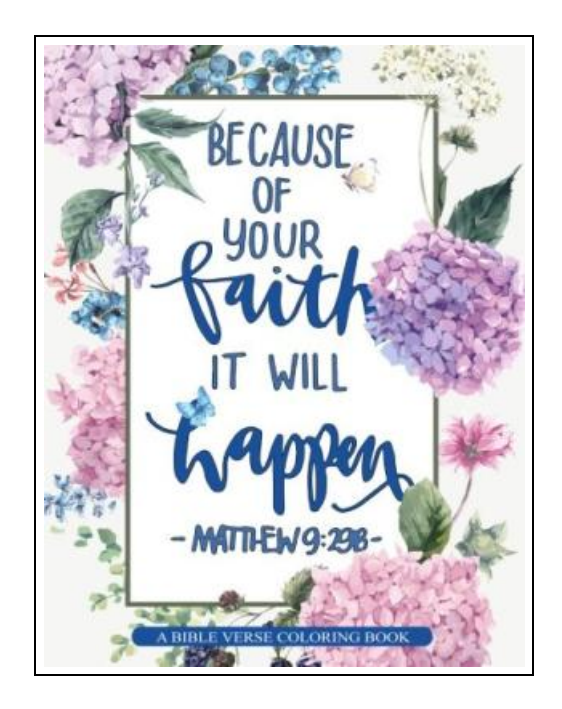
Filesize: 7.31 MB